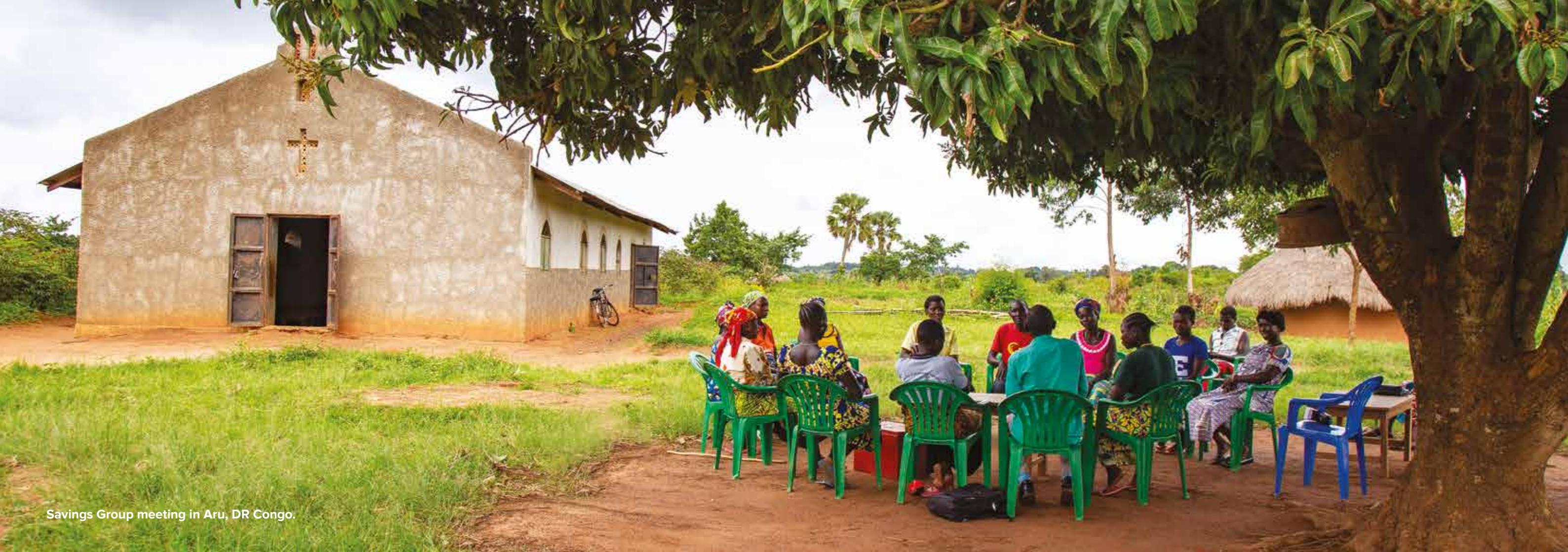
Savings Group meeting in Aru, DR Congo.